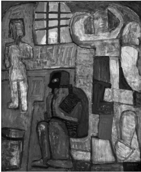
Sasza Blonder, Prison , 1934, oil on plywood, 108 x 90 cm. National Museum, Warsaw